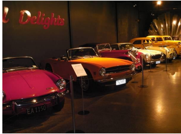
3 Triumphs, an MGTC & a Volvo at WOW