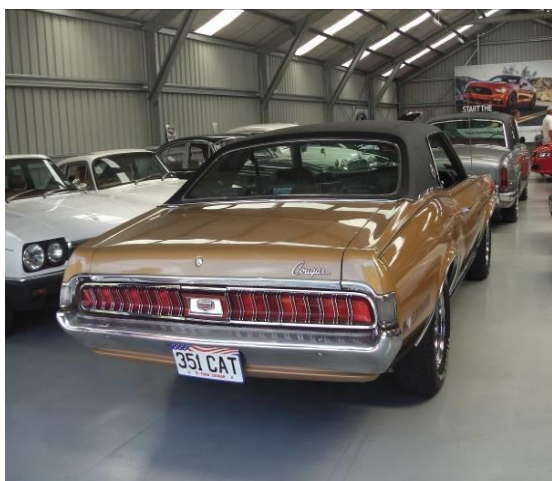
Colin Sweetman's Ford Cougar with the Rolls Royce Silver Shadow in front