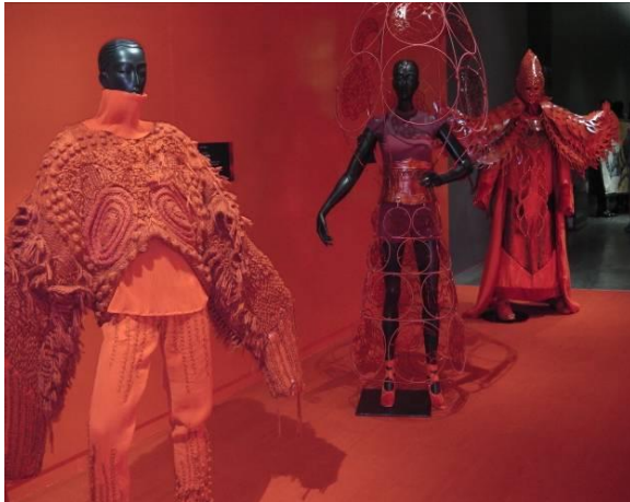
Some of the many WOW exhibits