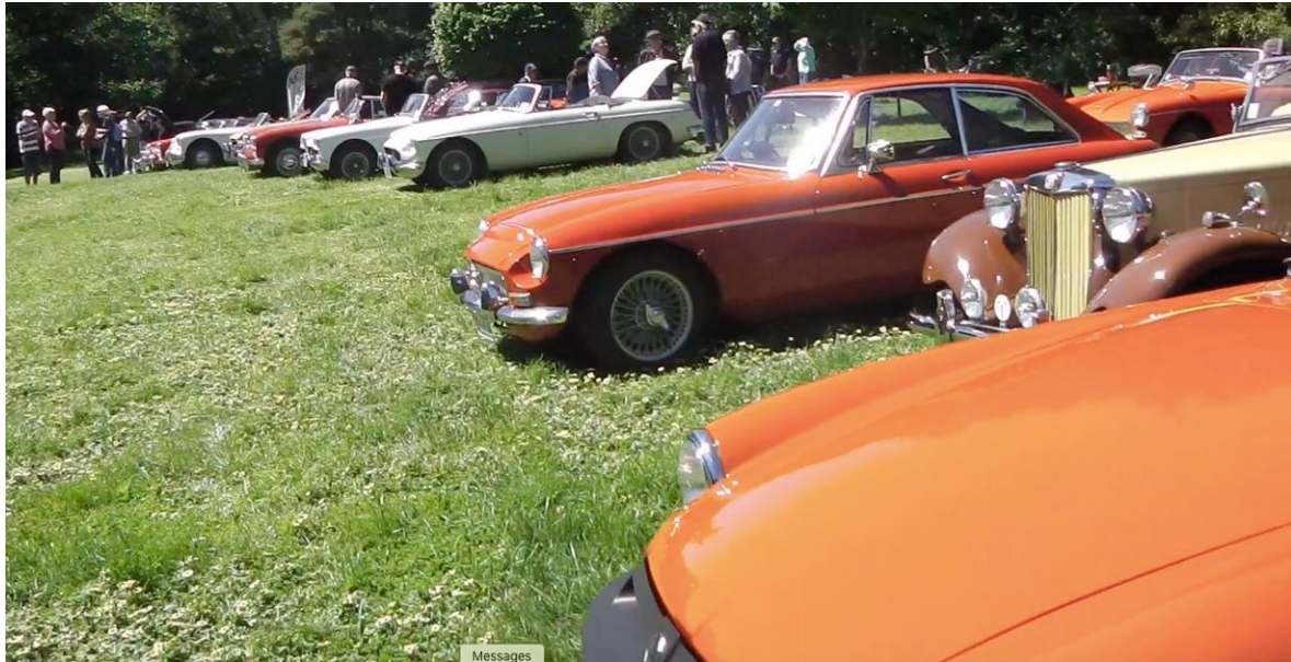
MGs at Orton Bradley Park