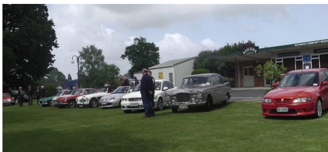
The other cars on the Mighty MGs Run

You couldn't pick a better group of people to go touring with!!