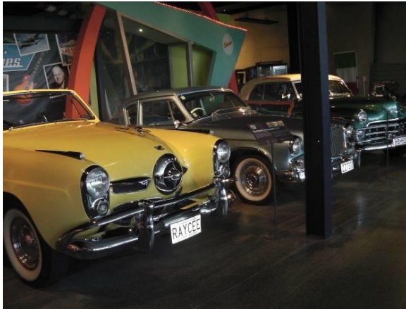
2 Studebakers at WOW