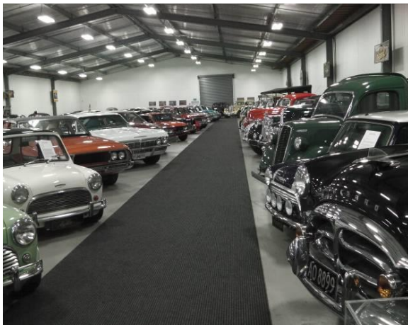
The private collection attached to WOW