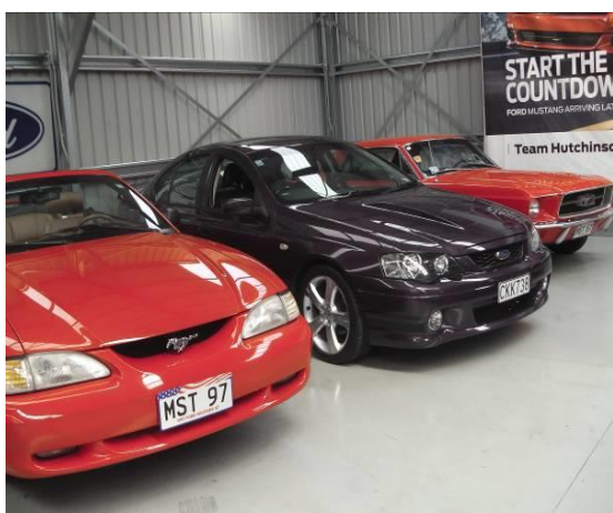
2 Ford Mustangs & a Ford Falcon in the Sweetman collection