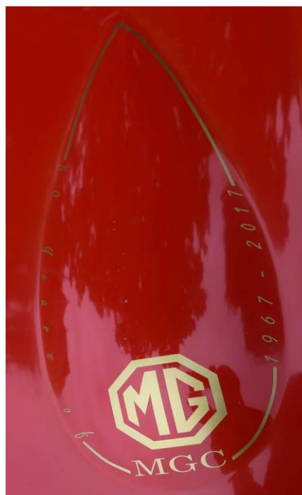
I knew that teardrop on the bonnet would come in handy sometime