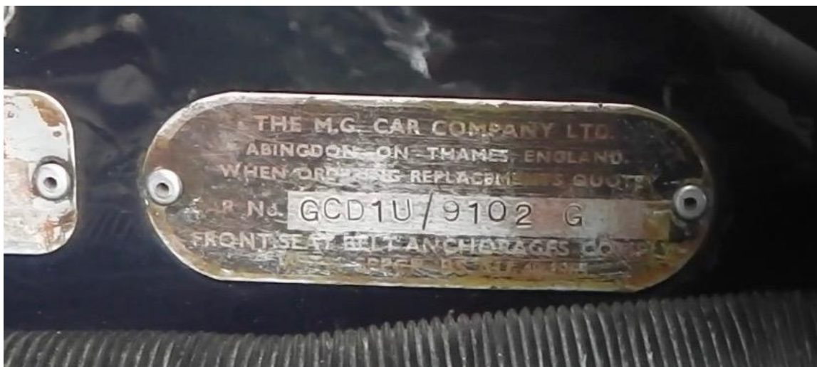
The chassis number plate of the very last MGC