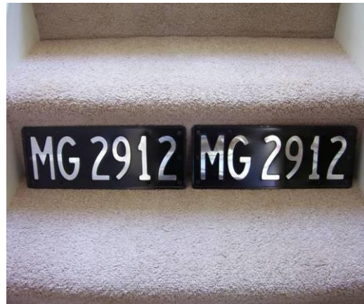
The perfect plates for the McMurray's CGT