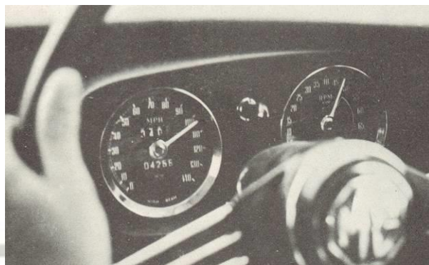
NOF 27F, when road-tested by Donn Anderson and cruising on the M1 with the speedometer needle touching 102mph at 4750rpm.