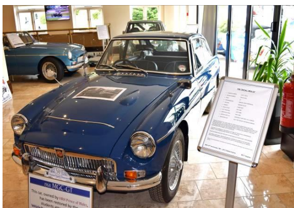
Display in the foyer at Chateau Impney, the Royal MGC, FRX 692C (prototype) & RMO 699F (factory GTS)