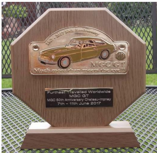
A closer look at Harvey's trophy