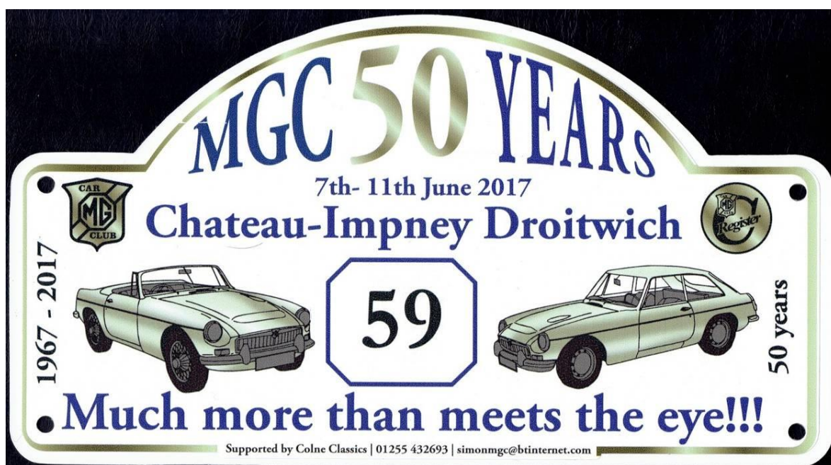
The event plaque as fitted to the front of each MGC