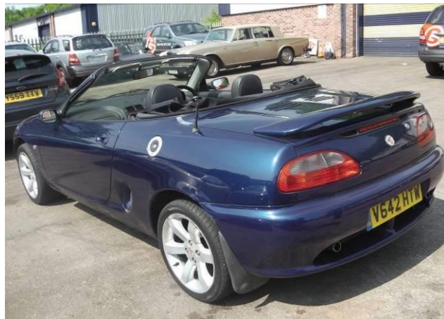
Our MGF VVC for the MGLive weekend